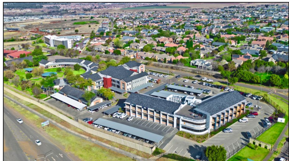
Midlands Office Park with Co-Work offices and Pre-primary school. The Dementia Care and Sub-Acute buildings are visible on the far left in the photo.