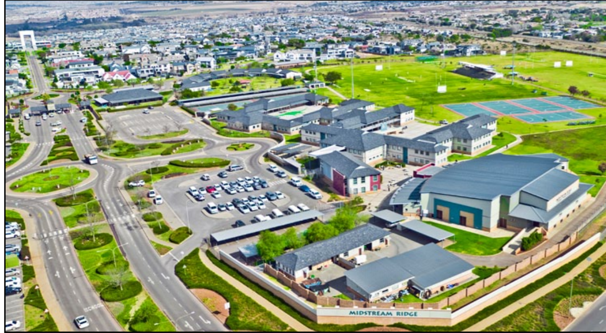
Entrance gate to Midstream Ridge Estate with Midstream Ridge Primary School.