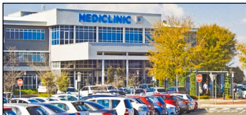
Mediclinic Midstream hospital.

The new bicycle club and shop provides a home base for