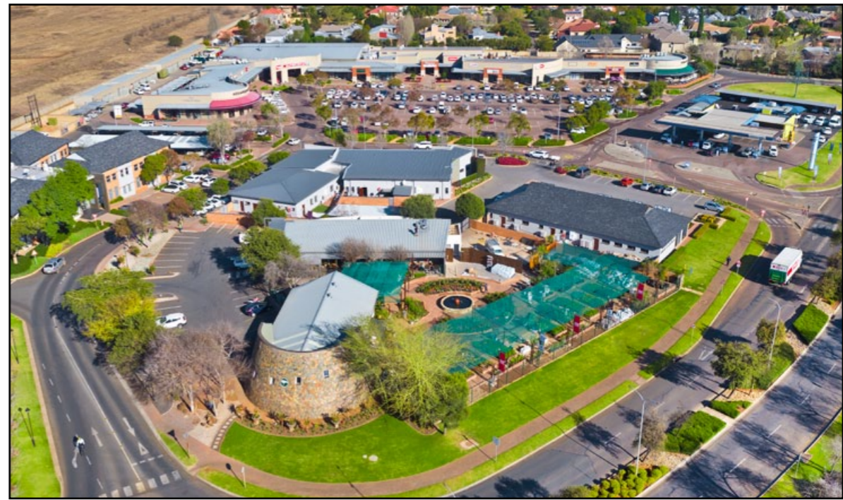
The Square@Midstream Shopping Centre with SASOL filling station and Garden Centre.