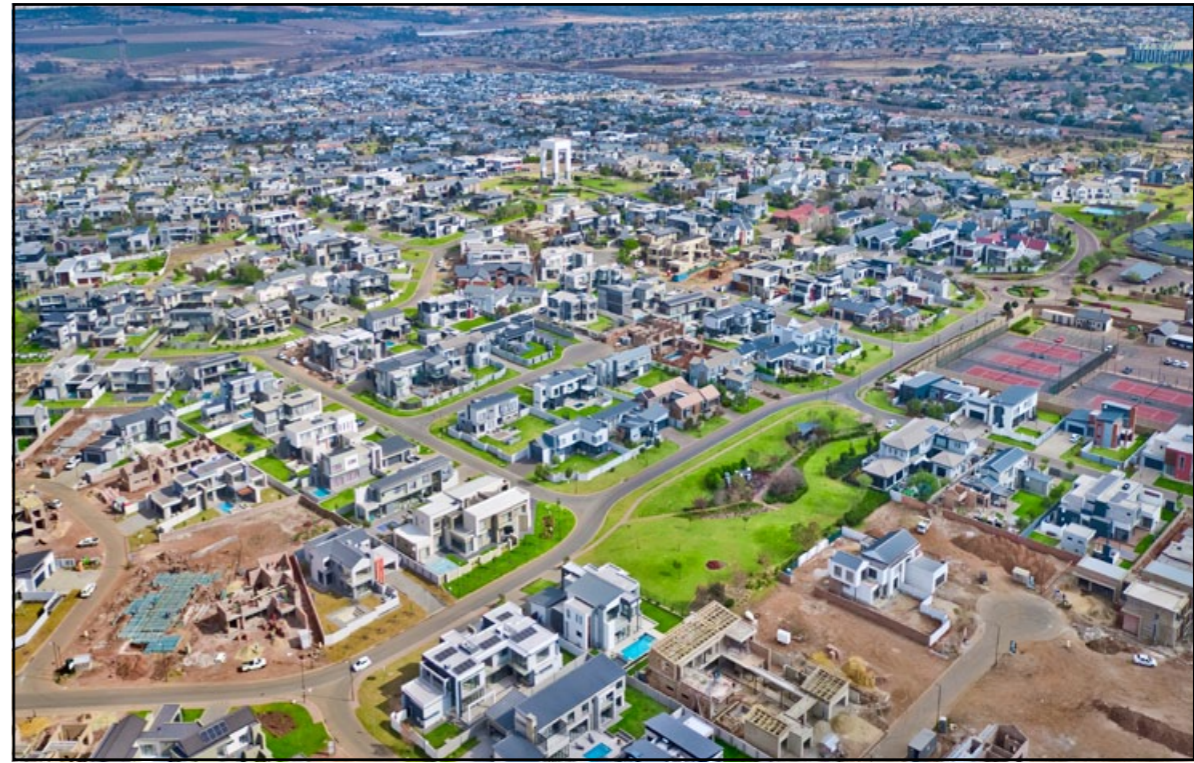
Landmark Tower of Midstream Ridge overlooking the luxurious homes and building projects.

Stay up to date with everything in the Estate by downloading the new Midstream APP on your smartphone. Information on everything happening in